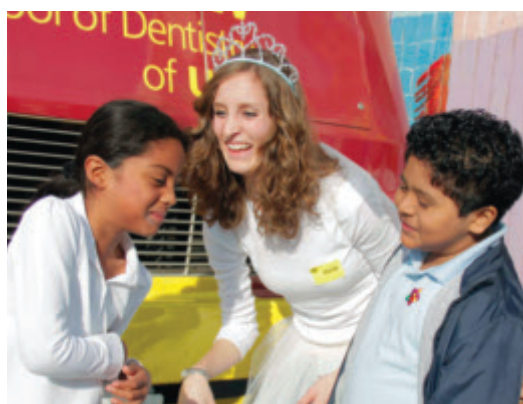
The Tooth Fairy spreads some magic.