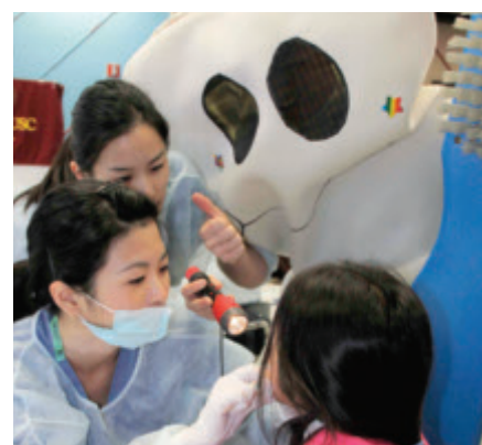
Mr. Molar says "Great Job!"