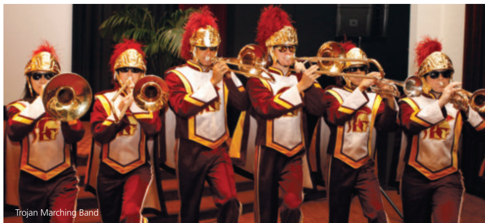
Trojan Marching Band