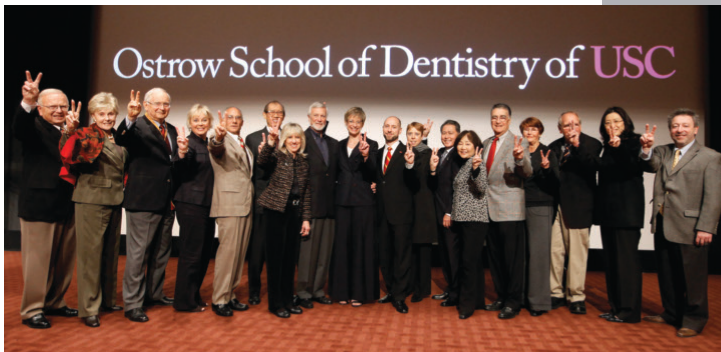
The Board of Councilors helped launch the campaign with a $10 million collective commitment.