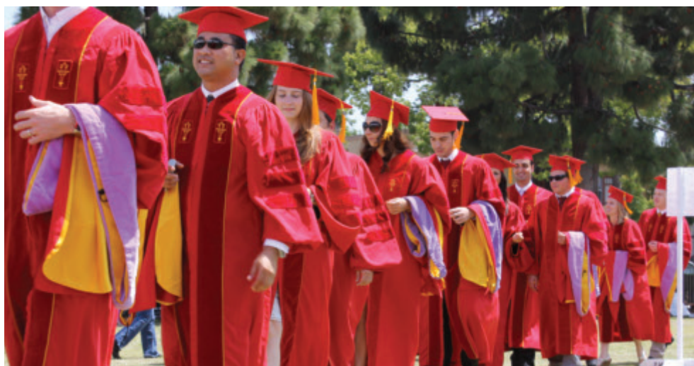
Ostrow grads march into their future.