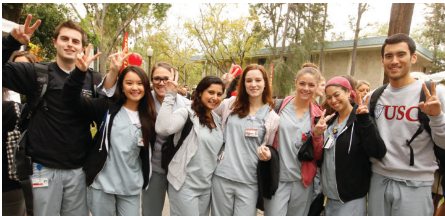
Dental students "Fight On!" for the Ostrow School.

For more Campaign Kickoff photos, go to tinyurl.com/ostrowkickoff