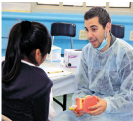
Foshay students received free screenings and oral care tips.

Give Kids A Smile Day On Feb. 3, Ostrow students, residents, and faculty provided hundreds of children at Foshay Learning Center with oral health education and supplies as part of Give Kids A Smile Day. This was Ostrow's tenth year participating in the nationwide service event.